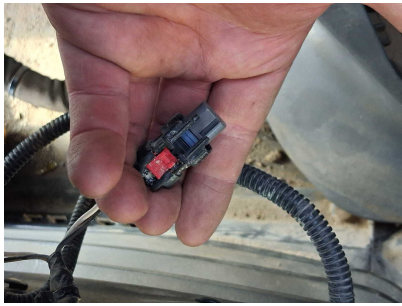
Image Comment(s): Seat not inflating/rising - 2 pin plug for compressor locking tab missing