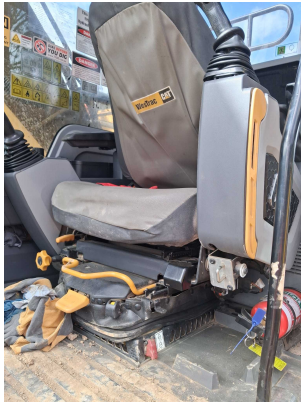
Image Comment(s): Seat not inflating/rising - 2 pin plug for compressor locking tab missing